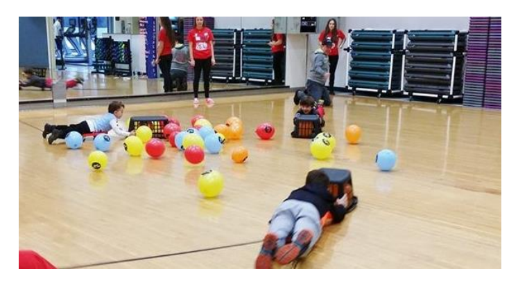
Photo Caption: Kids enjoyed playing "Hungry Hippos" and a variety of other active games at the North Suburban YMCA's Healthy Kids Day on April 25.