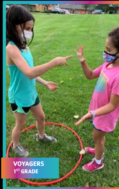
VOYAGERS 1 ST GRADE