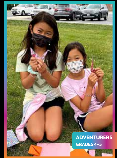
ADVENTURERS GRADES 4-5