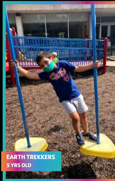
EARTH TREKKERS 5 YRS OLD

Swim lessons are available for Traditional, Navigator, and Sports Camp only. All swim lessons are facilitated by our Aquatics staff. Lessons take place each Tuesday and specific times will be assigned each week. $20 per lessons, per child. Swim lessons are an optional add on.