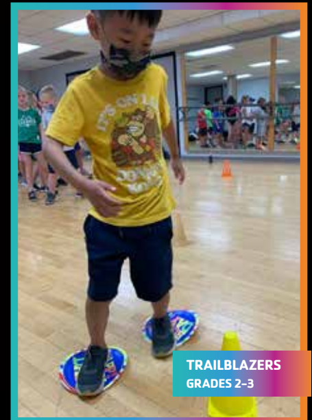
TRAILBLAZERS GRADES 2-3